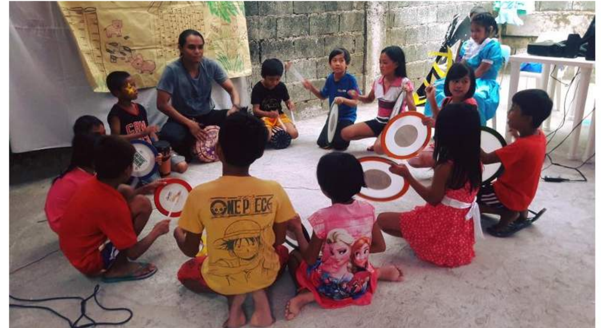
One circle, one beat: Drum Circle loud and proud during their performance