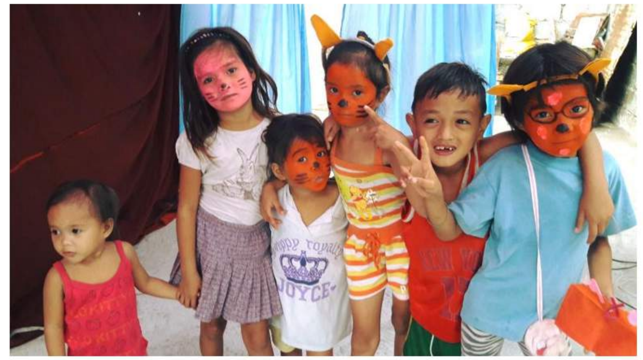
Happy Paint: Kinder kids enjoying their face painting and impersonation of animals in their performance.

Most of the children were nervous as it was their first time to ever perform. Nevertheless they persisted and with the help of their teachers, they were able to experience something new positively. The Festival started with Kinder Club's Peppa Pig inspired song and dance number. It was followed by Drum Circle's thundering drum routine. Dance Club came next with grace and poise to a hip hop tune. Drama Club presented their play entitled: "Ang Tatlong Kahiling" (The Three Wishes"), and it was followed with a screening of the Film Club's short films entitled: "One Eye Blind" (drama) and "My Sister hates My friends"(Horror). The Festival concluded with the screening of cartoons created by Animation Club.●