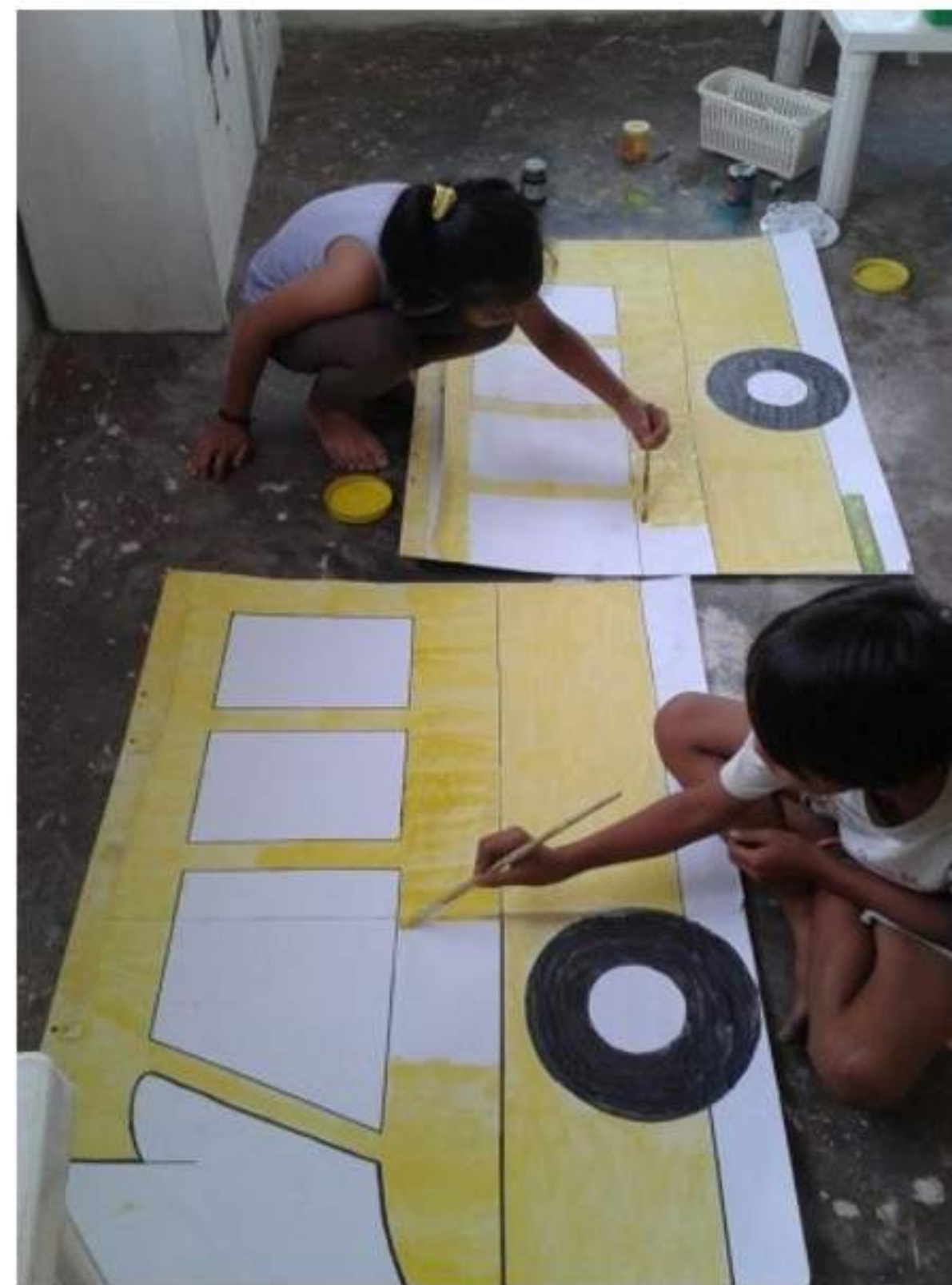
Production in Action: Production Design members create the school bus prop for the Kinder's performance.