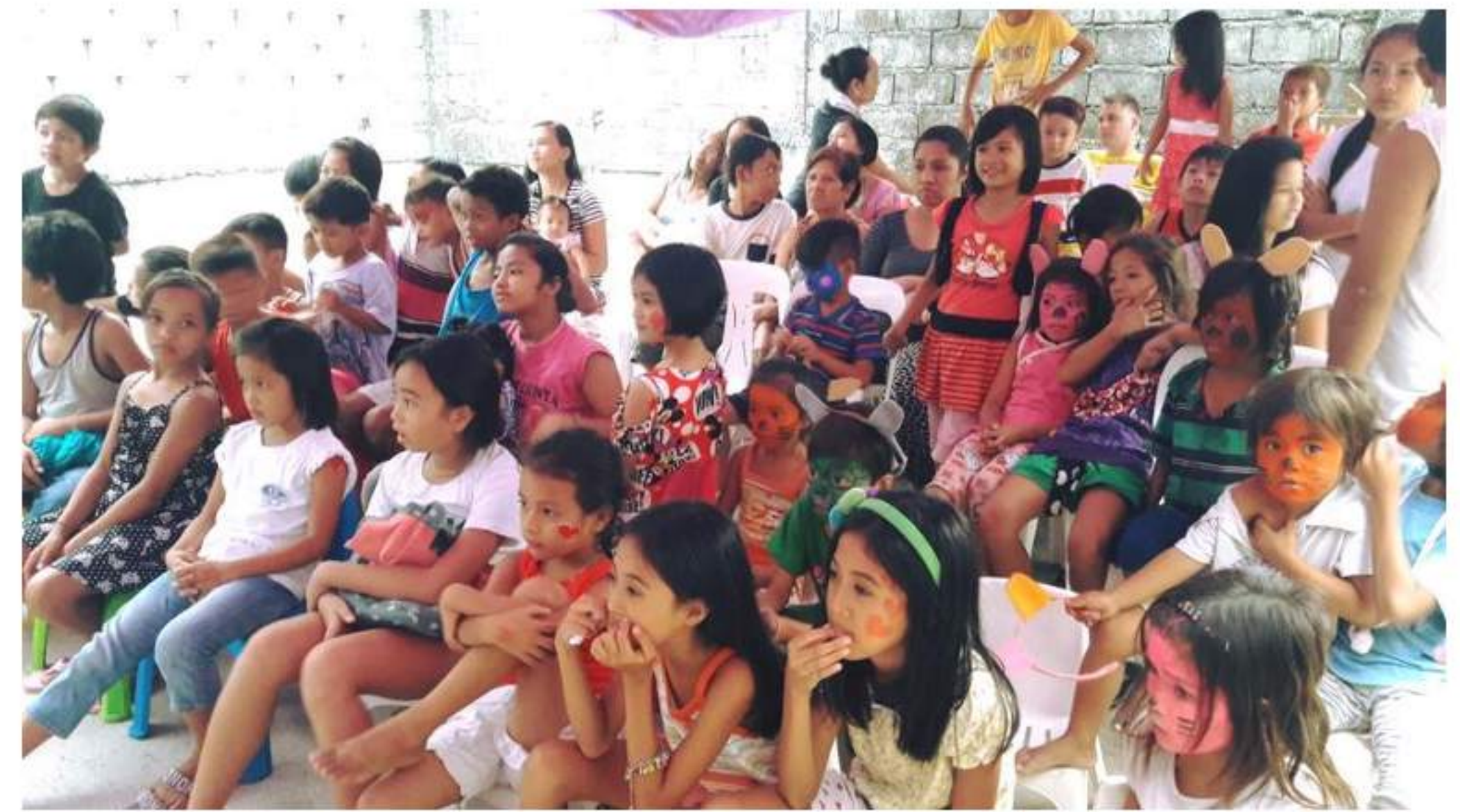
Packed and Engaged: The crowd watching the recital.