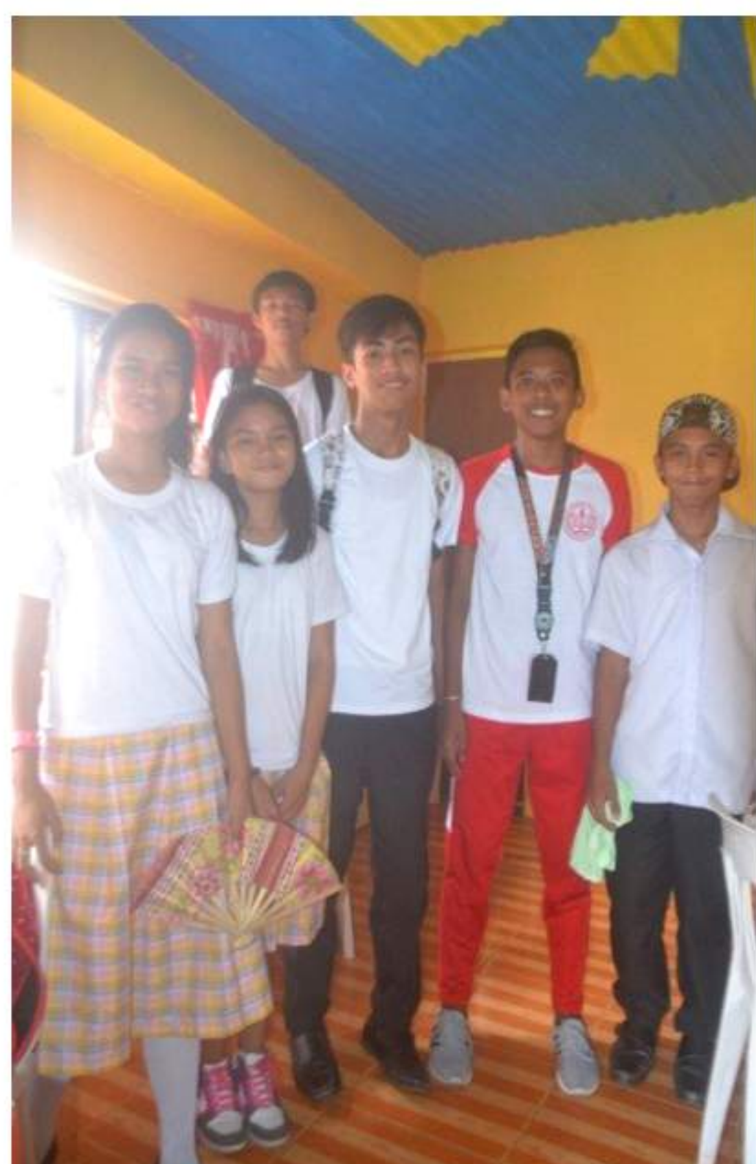
High school kids arrive in the Fairplay Cafe after school to have lunch.

There are currently 42 kids in the Education Sponsorship Program. 18 are in elementary school, 17 in secondary and 7 in senior high. The Program spends roughly PHP 2,000-2,300 (£32) per kid in preparation for the new school year. This covers 2 sets of school uniform, 1 pair of black shoes, 1 pair of rubber shoes, 2 sets of undergarments, 1 school bag and assorted school supplies. The rest of the year, the Program spends an average of PHP 1,000 (£16) per month per sponsored kid for their meals, transportation, and school projects. Thank you to all sponsors who continue to support the education of our scholars!